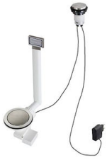
VIDAGE FADE LIGHT A407 A17